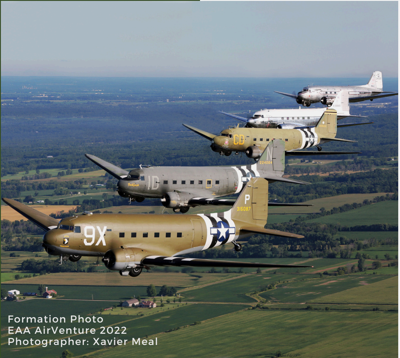
Formation Photo EAA AirVenture 2022