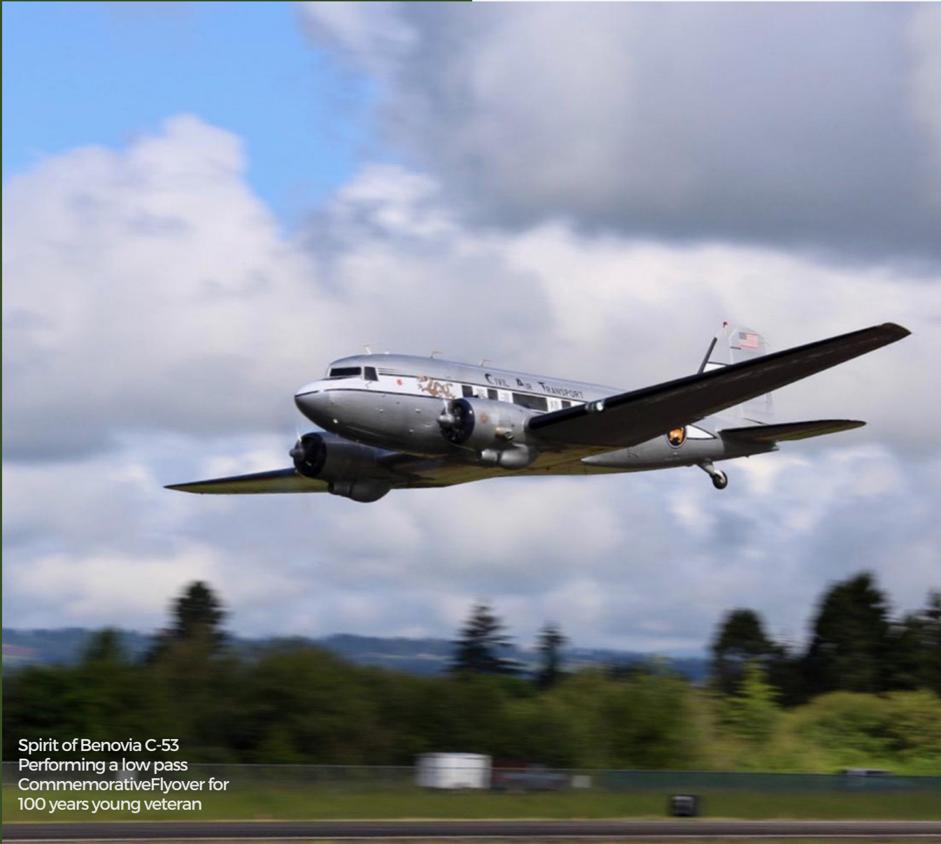
Spirit of Benovia C-53 Performing a low pass Commemorative Flyover for 100 years young veteran